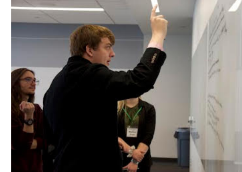
Students Engaged in Presentation Preparation!