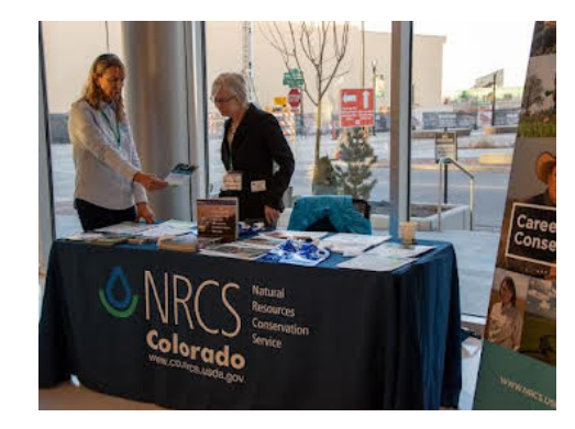
Featured Natural Resource and Agriculture Career Fair!